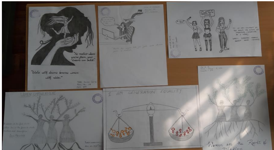
Sketches on the Theme done by 2 nd Semester Students