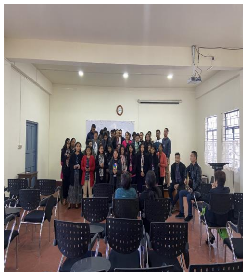
Group song by 2 nd Semester Students