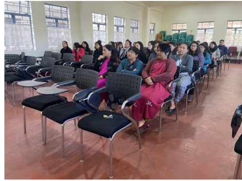
Faculty members and student-teachers during attending the celebration